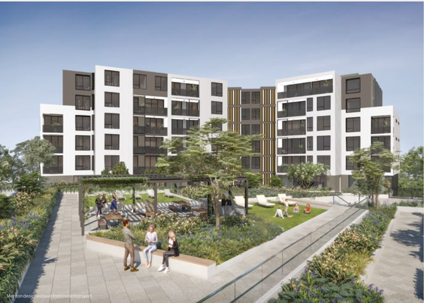
Meriton designed pool from recent project