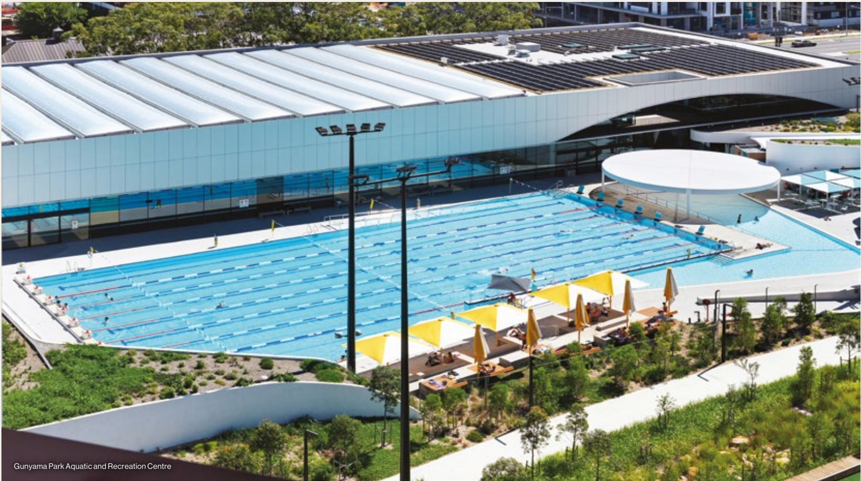
Gunyama Park Aquatic and Recreation Centre

Bus services to the CBD leave every 7 minutes from your doorstep during peak hour. While the Green Square train station puts you within easy reach of the city centre and Sydney Airport – it's only 1 stop to Central and 2 stops to the airport.