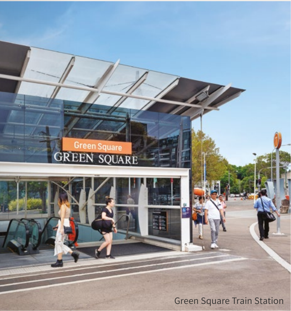
Green Square Train Station